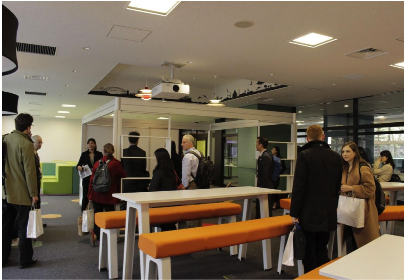
Figure 2. Teachers touring the new ELF Study Hall during the ELF orientation.