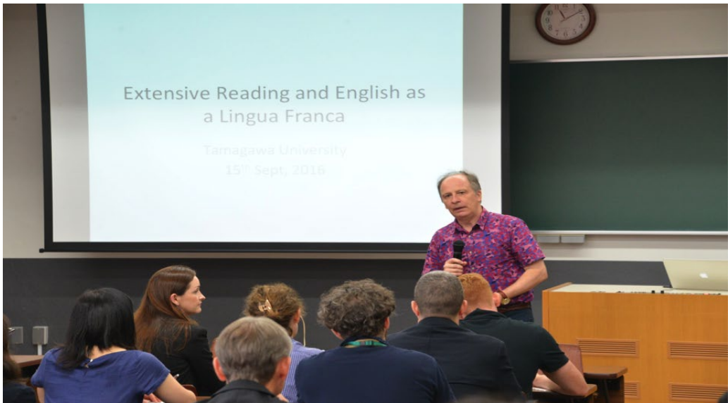
Figure 1. Dr. Robert Waring speaking at the ELF Forum (September 15, 2016).