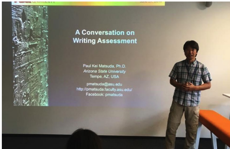
Figure 4. Dr. Matsuda's lecture (June 27th, 2016).