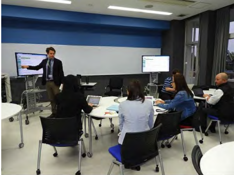
Figure 6. A CELF workshop on the Blackboard course management system (CMS). Retrieved from http://www.tamagawa.ac.jp/celf/news/detail_006.html