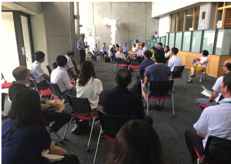
Figure 4. CELF faculty giving the CELF Report in the Tamago Lounge

This collaboration between the CELF Forum and ELTama has enabled a diverse group of language teaching professionals to share and discuss a wide spectrum of topics related to research and classroom practices concerning English Education and ELF.