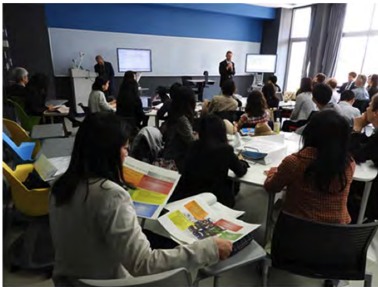
Figure 5. CELF teachers gathered for the 2018 Teacher Orientation Meeting on March 28th.