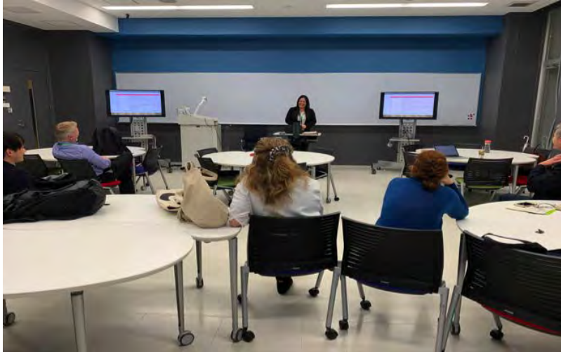
Figure 9. Participants at the informal discussion for CELF teachers on December 8th, 2018.