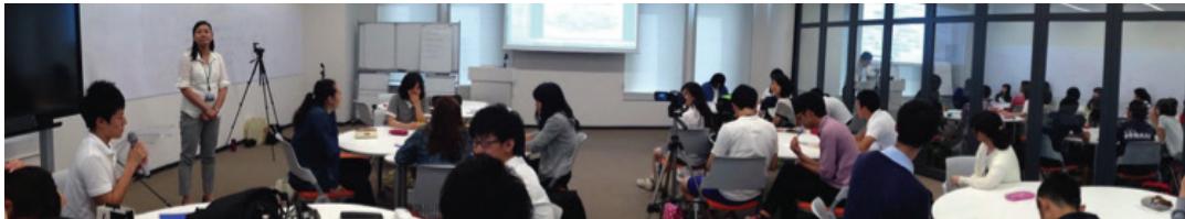
Figure 3. Focus group discussion

The group presentations were video recorded and followed immediately by a twenty-minute Focus Group Discussion (FGD). The FGD was used to help elicit student insights which may otherwise have remained hidden via an exchange of experiences and points of view (Green & Hart, 1999; Litosseliti, 2003). As with the group presentations, the two FGD sessions were comprised of groups from both of the classes. Each FGD was video recorded. Student and tutor verbal consent for the use of all audio and video clips for research purposes was obtained.