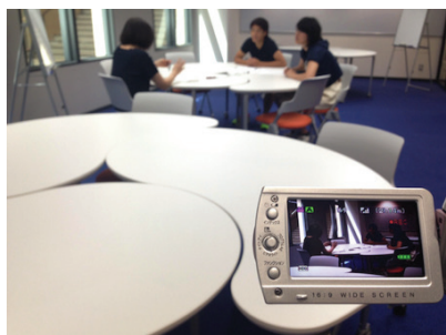
Figure 2. A tutor session