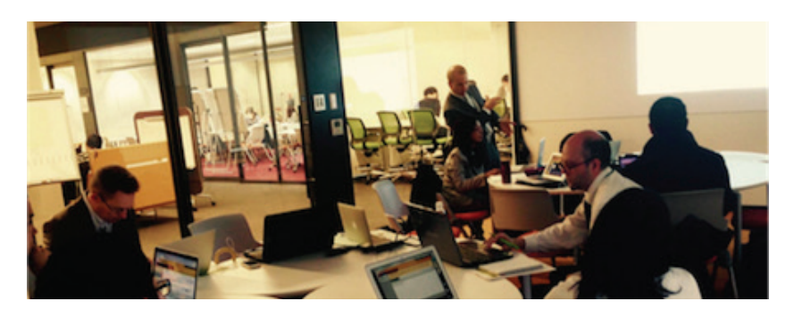
Figure 3. A Blackboard CMS training on April 20th, 2015.

All teaching resources and administrative information for CELF classes are available on the university Blackboard course management system (CMS) and the ELF center's teachers have been noted as the heaviest user group on the campus (Cote & Milliner, 2015). However, usage statistics revealed that only two-thirds of the CELF faculty are actively utilizing the system to manage such tasks as classroom assignments, student assessment and flipped learning (Cote & Milliner, 2015). To bridge this gap, as well as train new teachers, the CELF staged 2 workshops in the spring semester which focused on basic functions of the Blackboard system, and 2 workshops in the fall semester which focused on creating and managing online testing using the Blackboard focusing on creating and managing online testing. Throughout 2015, CELF faculty investigated how teachers in the program used the CMS and those findings directed current and ongoing research into how the teachers might be trained to more effectively use the system.