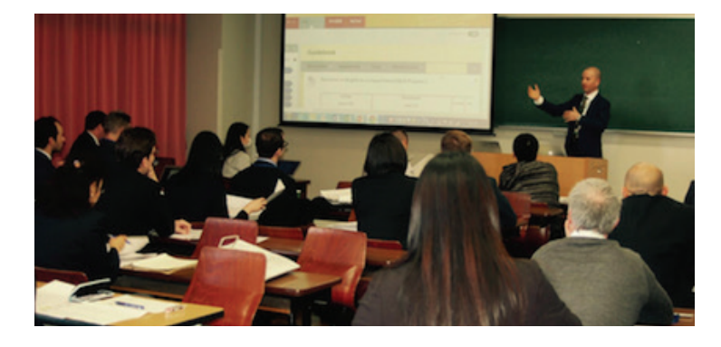
Figure 2. The ELF Teacher Orientation on March 25th, 2015.

After the two-hour program, teachers were divided into smaller groups to tour the university's facilities and become acquainted with classroom audiovisual equipment.