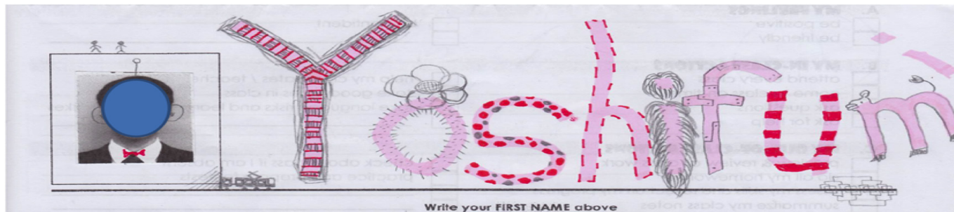
The 'Name & Photo' component of the student nameplate

Note: *Students write their (in-class) name and attach their photo in the space provided.